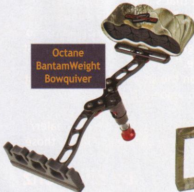
Octane BantamWeight Bowquiver