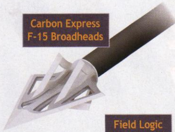
Field Logic Block Fusion