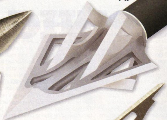
CARBON EXPRESS F-15