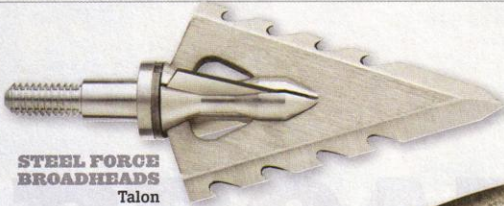
STEEL FORCE BROADHEADS Talon