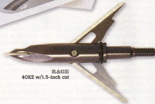
RAGE 40KE w/1.5-inch cut